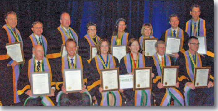
New Texas Fellows